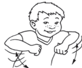
d Flap elbows like a waddling duck.