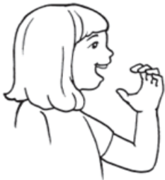
a Bite an imaginary apple.

The actions are designed to be performed either sitting or standing. Where relevant, children should be facing in the Reading Direction.