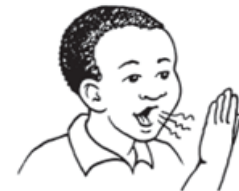
h Breathe on to hand in front of mouth, OR put on imaginary hat.