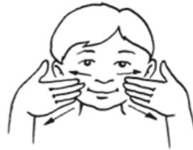
c Stroke whiskers across cheeks.