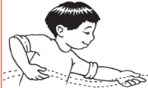
f Hold and direct imaginary hose towards fire.