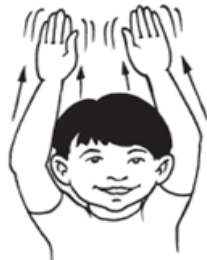
b Shoot arms up for ears and wiggle them.