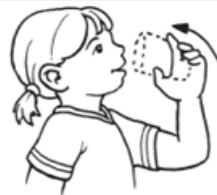
g Mime holding tipped glass of grape juice in 'glug, glug' position.